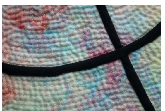
Detail image of artwork

The detail image of the back of the artwork as well as the close-up image shows the extensive stitching at its best along with the flow of colors across the textile. This artwork is designed to be displayed in either a vertical or horizontal orientation which allows for versatility in displaying the artwork spatially and visually.