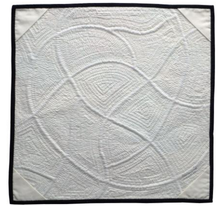
View of back of artwork